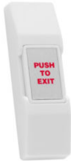
Figure 1: EX-01 Push-to-Exit Button