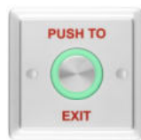
Figure 2: EX-M04 piezoelectric button switch with a green LED ring and 'PUSH TO EXIT' text.