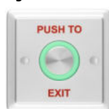
Figure 2: EX-M04 piezoelectric button switch with a green LED ring and 'PUSH TO EXIT' text.